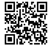
TABLE OF 10 - $650